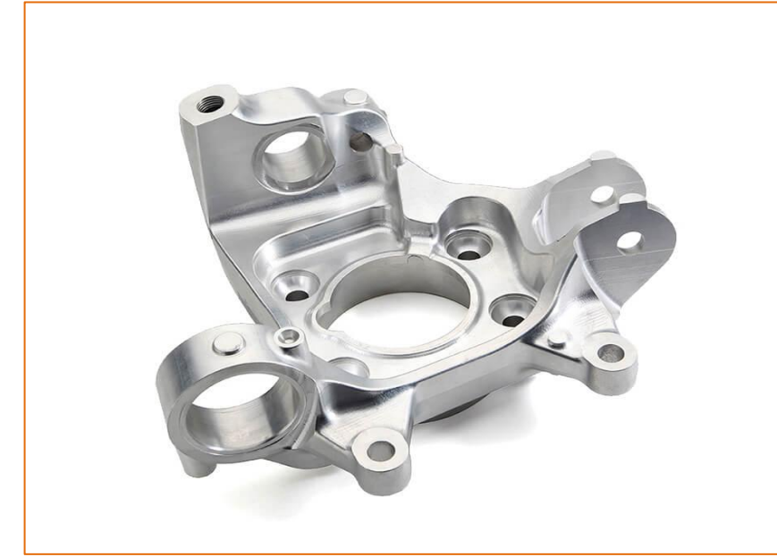
CNC Milling products