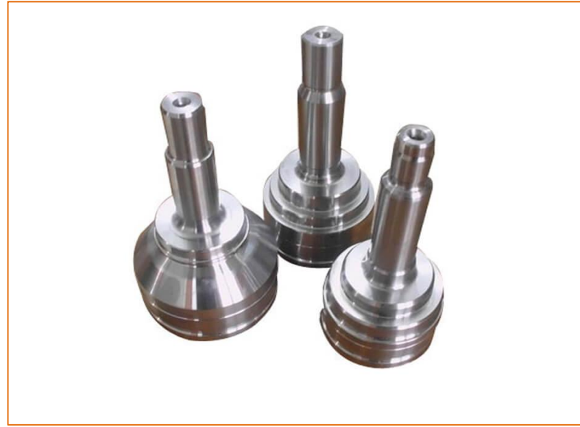
CNC turning products