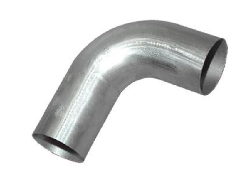
Pipe bending products